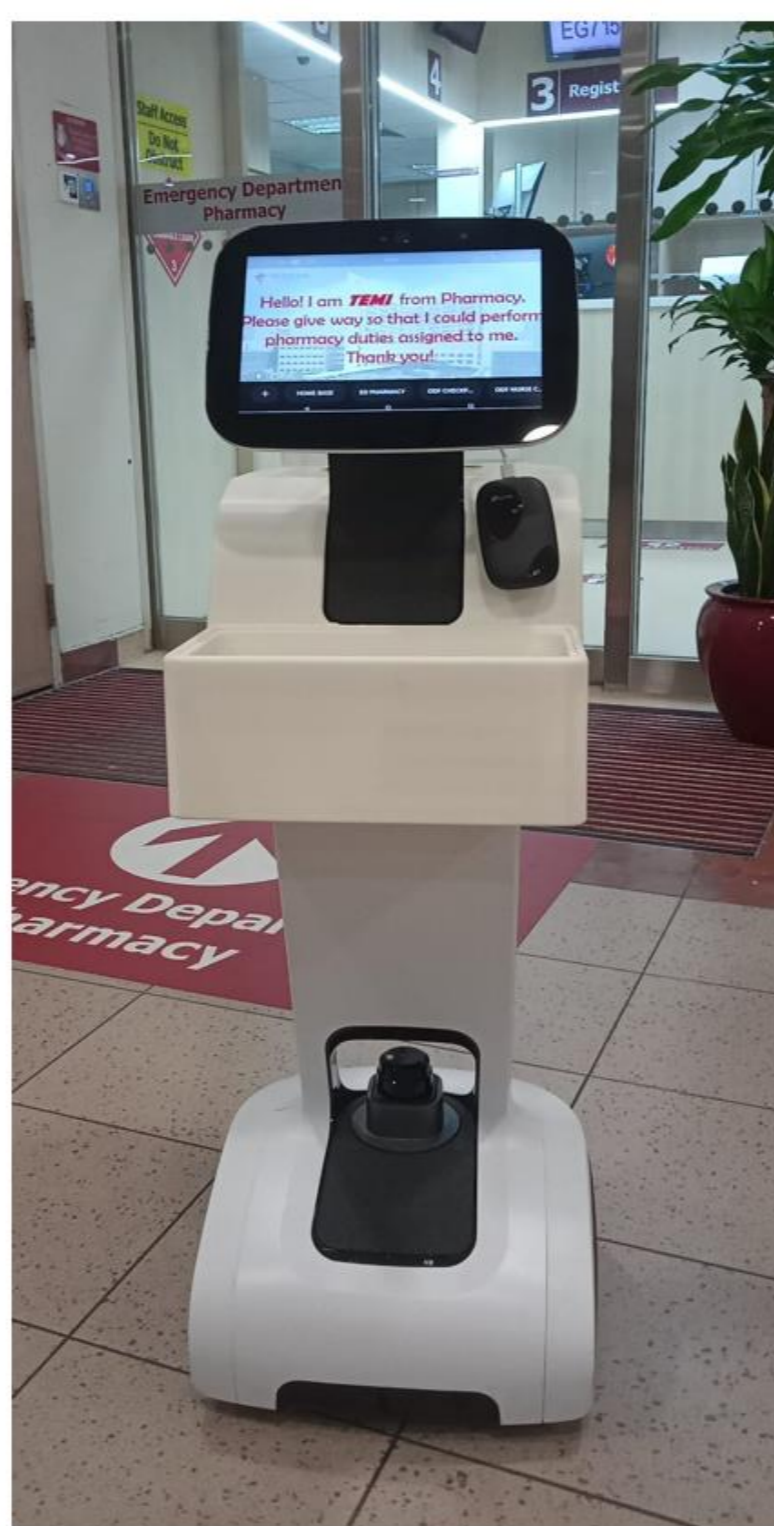
PillBot modified with a 3D printed storage box for medication delivery and transportation