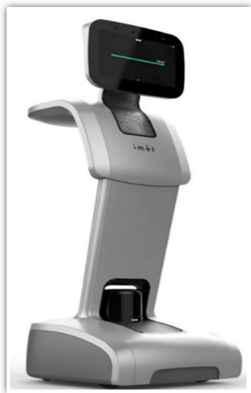
Original PillBot (TEMI robot)